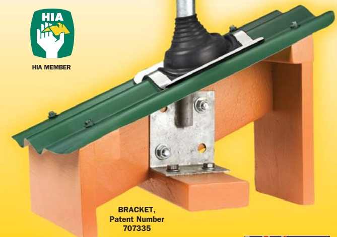
BRACKET, Patent Number 707335

Proudly Australian Made, by an Australian Company, using Australian Products