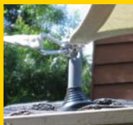
ANCHOR, Patent Applied For 2006200720

Now attach shade sails to existing buildings. Easy to install through tile and metal roofs.